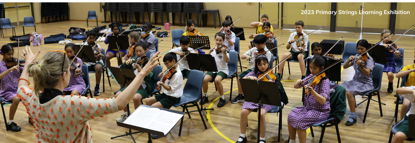
2023 Primary Strings Learning Exhibition

Information about the Learning Exhibitions are on pages 11 & 12. For any further clarification regarding these events, email captivate@parra.catholic.edu.au