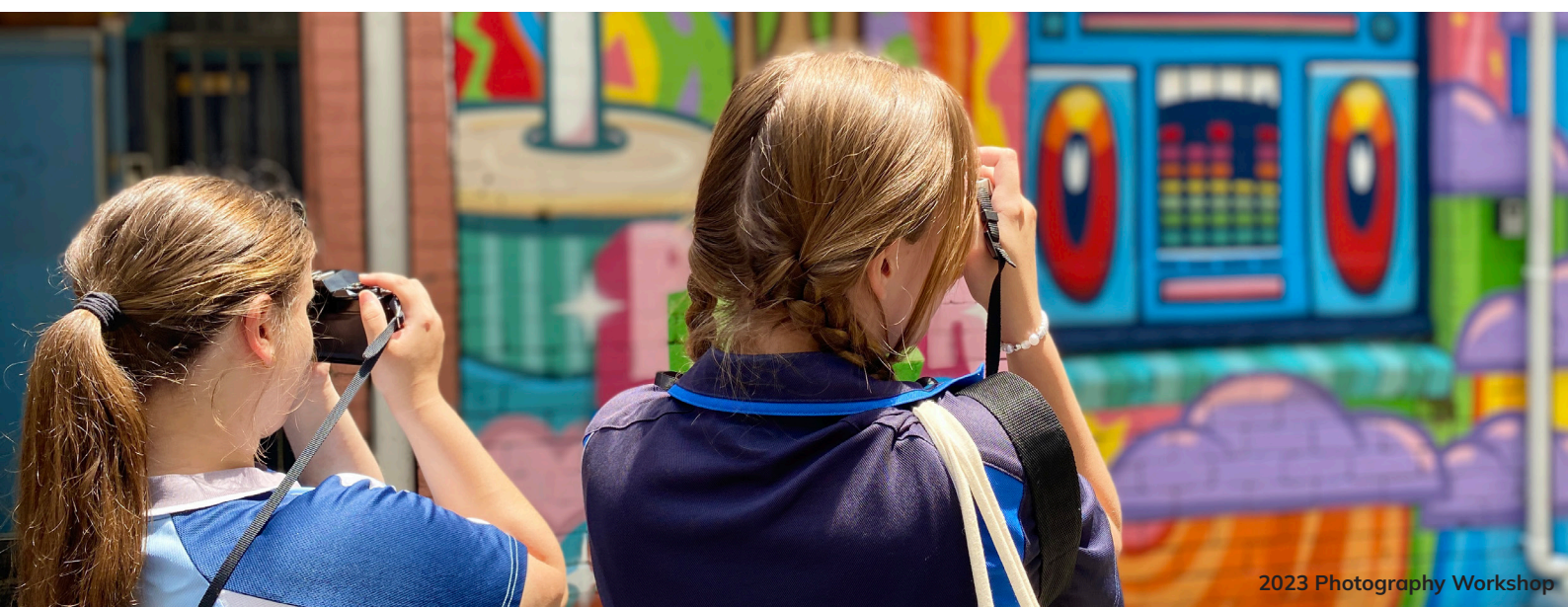
2023 Photography Workshop