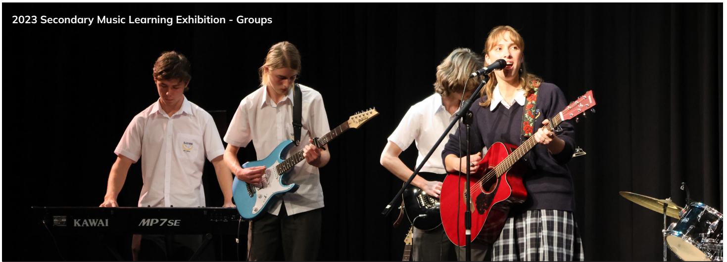
2023 Secondary Music Learning Exhibition - Groups

Arts Factor is open to Primary and Secondary CSPD schools and will run in Terms 3 & 4.