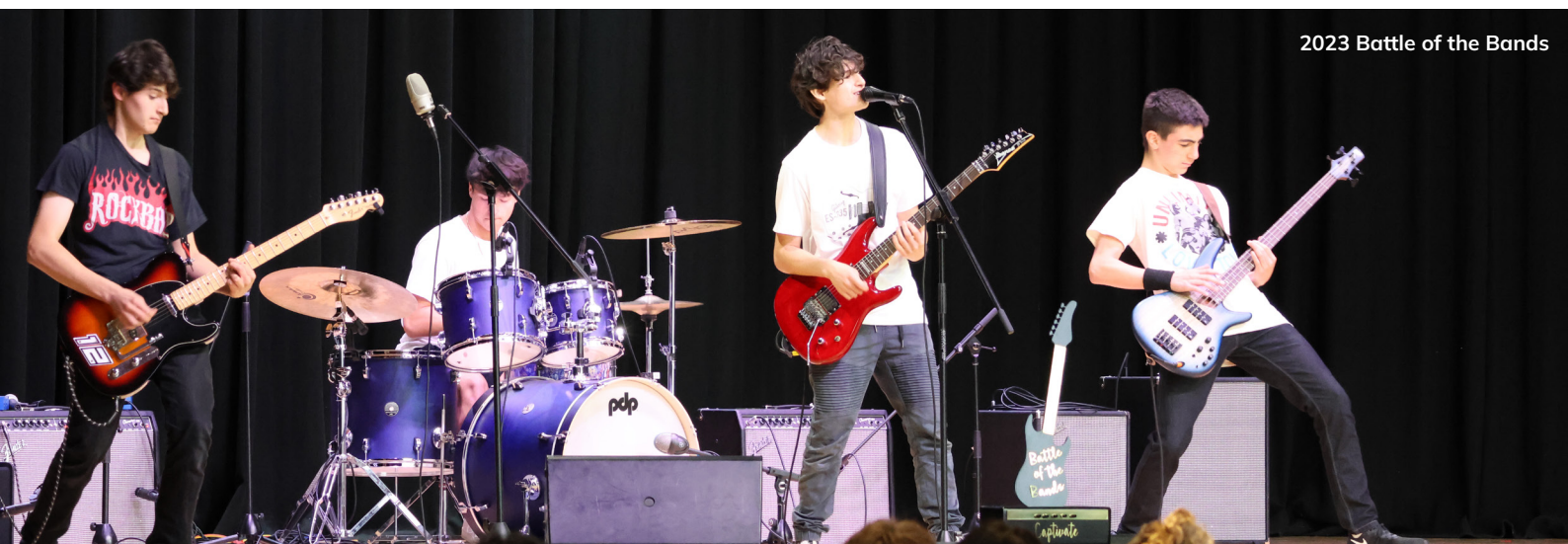
2023 Battle of the Bands