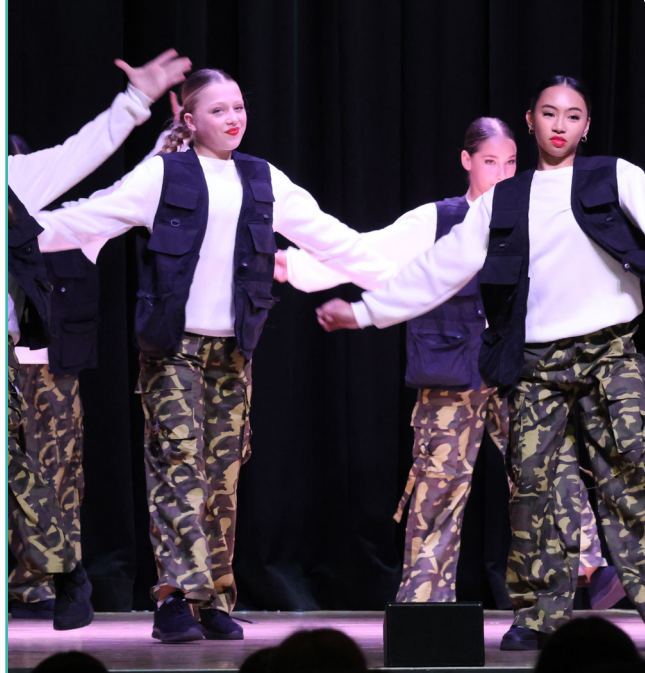
2023 Dance Festival

Time: Full Day- Times TBC based on registrations