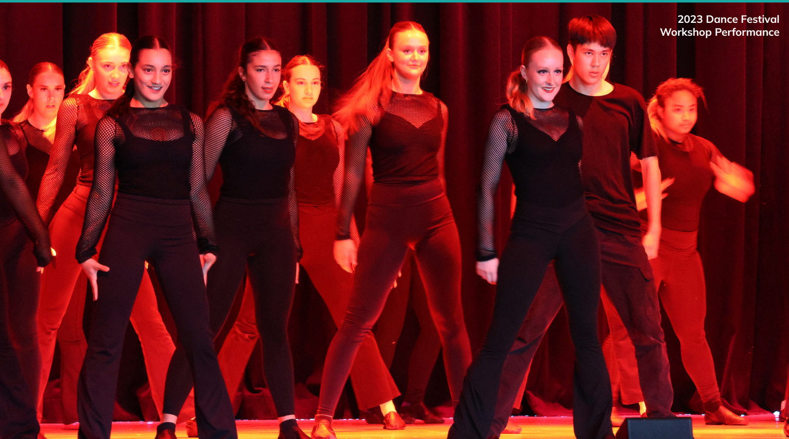
2023 Dance Festival Workshop Performance

It is compulsory for invited students to attend all 4 workshops and the Dance Festival.