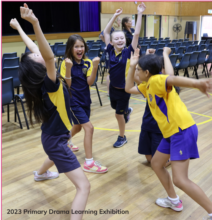
2023 Primary Drama Learning Exhibition

Please note: For each event to run a minimum number of schools/students will need to register.